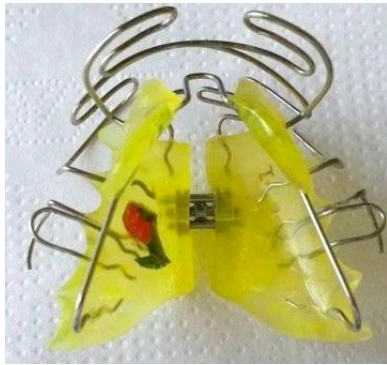
Figure 3 - SN 9 modified type functional orthopedics appliance

Maximum molar bite force was measured using a digital dynamometer (IDDK; Kratos, Cotia, SP, Brazil) with a capacity of 1000 N (Figure 2). Measurements were taken first on the right and then on the left side, where the strongest bite was developed. During measurement, the patient was sitting on a chair with her arms extended beside her body and her hands resting on her thighs. She was instructed and trained in how to bite the equipment, ensuring procedure reliability. The dynamometer was cleaned using alcohol and protected with a disposable latex cover (Wariper, Sao Paulo, SP, Brazil), which was used as a biosafety measure. Three measurements were taken for each side, alternating between the sides with a 2-minute break between each bite. The maximum bite force was recorded as the highest value for each side.