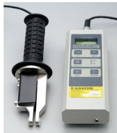
Figure 2 - Digital dynamometer, model IDDK