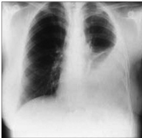
Figure 2: X-ray chest showing left-sided pleural effusion