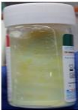
Figure 1 – Dark yellow pigmented colonies on LJ medium

CT scans of the chest and abdomen as part of the work up were normal. Initial blood cultures from peripheral line and from the port were sterile. She did not respond to antibiotics and had worsening of her fever, which was now associated with increasing fatigue and dry cough. Blood culture was repeated from both peripheral venipuncture and the port by BacT/ALERT® 3D (bioMérieux). Blood culture from port catheter signaled positive after 44 hours and from peripheral venipuncture site signaled positive on the third day. Gram stained smears from both the vials showed weakly stained gram positive bacilli in clusters. Ziehl-Neelsen staining on both the samples showed acid fast bacilli (AFB). The sample was sub cultured on blood agar, Macconkey agar and Lowenstein-Jensen (LJ) medium. There was growth on blood agar but not on Macconkey agar. It took 5 days for growth on LJ medium.