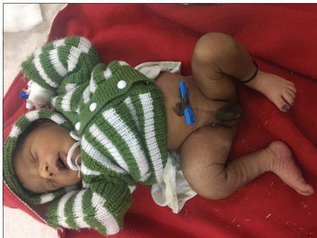
Figure 1: Showing swelling and deformity over right thigh