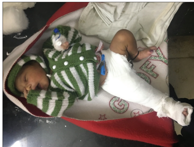
Figure 3: Toe-groin cast applied after reduction under image intensifier