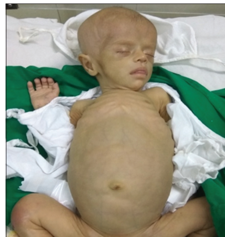
Figure 3: Neonate on day of life 40 shows marked emaciation with dysmorphism becoming more apparent

as in our case, or in a mosaic; the occurrence of TMD may be the first indication that the child has trisomy 21. In this situation, the application of Hall's criteria may aid in the diagnosis; however, the diagnostic gold standard remains karyotyping.