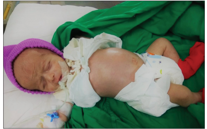
Figure 1: Neonate on admission, with gross abdominal distension, no dysmorphic features present

Trisomy 21 or DS is the most common chromosomal abnormality in humans and confers a higher risk of developing leukemia in childhood. Occasionally, when the phenotypic features are subtle,