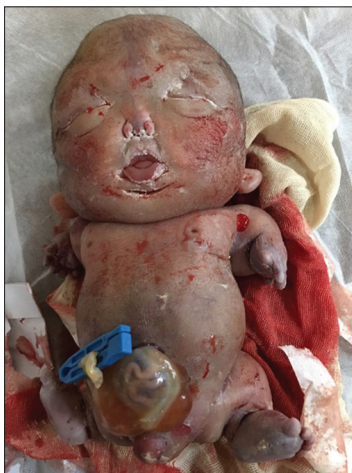
Figure 1: Stillborn male baby with hypertelorism, flat broad nasal bridge, midfacial hypoplasia, severe micromelia, narrow chest, and exomphalos

Despite the extensive knowledge about skeletal dysplasia and their elaborate classification, skeletal dysplasias with the poor or no mineralization of bones at birth are few and some of them are very rare. Among them, a few to be considered in particular are achondrogenesis, campomelic dysplasia, Roberts syndrome, and thanatophoric dysplasia. These can be often diagnosed on a detailed assessment of the clinical examination, associations, and the pattern of the loss of mineralization. The severity of decreased ossification and phenotypic features helped in pointing out the diagnosis of BD.