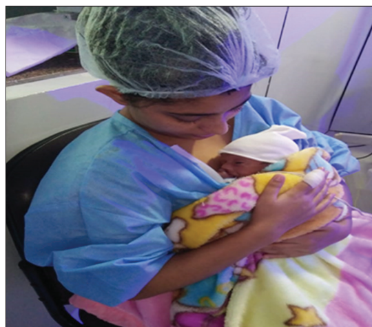
Figure 3: A mother doing kangaroo mother care