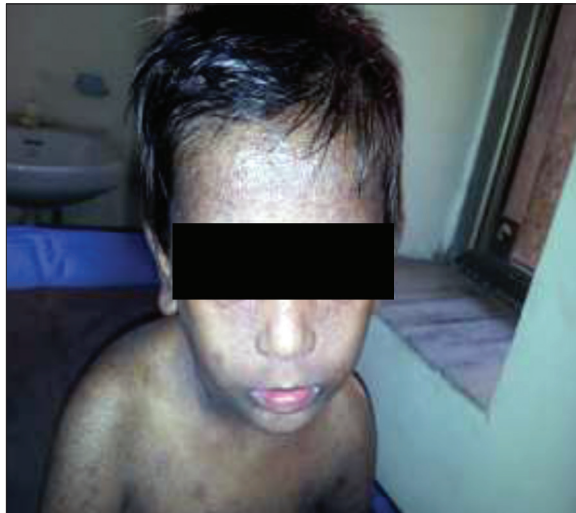
Figure 1: Scaly, symmetric, papular, and eczematous skin lesions on forehead and shoulder

Patients with single system disease can generally be cured with conservative management and overall survival is about 100% in almost all series. Multi-system disease without organ dysfunction has been associated with, a chronic course, a high rate of morbidity and low mortality. Those patients with organ dysfunction require polychemotherapy because they have a life-threatening disorder [10-13].