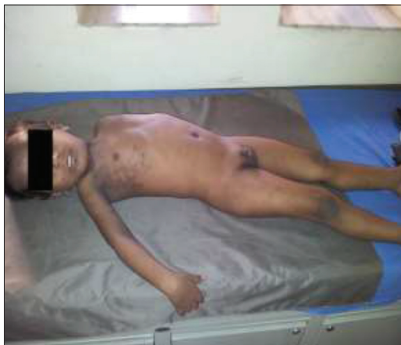
Figure 2: Skin lesions on axilla, chest, and forearm