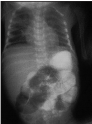
Figure 2: Gastrografin contrast study of the upper gastrointestinal tract shows distended small bowel loops

delayed in case of preterm infants. NSLC is one of the causes where the meconium passage can be delayed. More than half of the infants are borne to the diabetic mothers [5]. There is functional colonic obstruction due to transient dysmotility. This primarily affects the rectum, sigmoid colon and descending colon. In our case, the colon from the splenic flexure to the proximal sigmoid was affected. The newborn usually presents with vomiting, abdominal distension and history of not passing meconium.