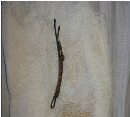
Figure 2: Foreign body retrieved from duodenum after open surgery

site at which progression is impeded in GIT includes pylorus, junction of the second and third part of the duodenum, ileocecal junction, lumen of appendix, junction of cecum and ascending colon, flexures, and haustra of large intestine causing impaction of foreign body [6-8]. In this case, hairpin was impacted in the junction of second and third part of duodenum for around 1