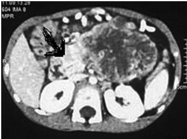
Figure 1: Contrast-enhanced computed tomography of abdomen showing neoplastic mass in pancreas (arrow)