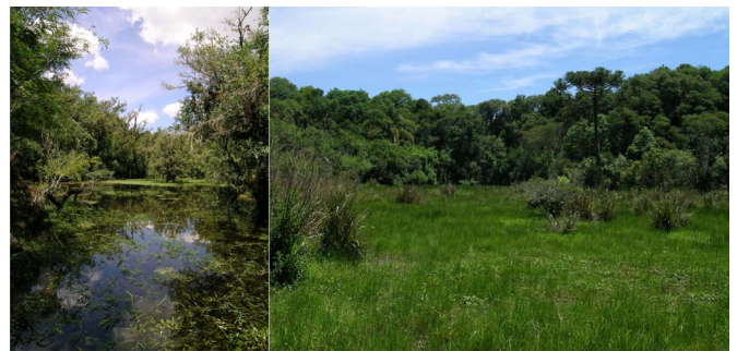
FIGURE 3. Two different collection sites of Dendropsophus nahdereri in locality 2, Florestal Gateados, municipality of Campo Belo do Sul, Santa Catarina state, Brazil.

Conte and Rossa-Feres (2006) observed males of one population of Dendropsophus nahdereri in Paraná calling in the rainy and warm season (September to January). Orrico et al. (2009) registered calling males in the state of Santa Catarina in winter and spring (August, September and December), and Conte et al. (2010), in other localities in Paraná and Santa Catarina, registered males from August to November. We found males in southern Santa Catarina and Rio Grande do Sul calling mainly in spring (September, October and November), however we also observed males calling in autumn and winter (April, May, June and July).