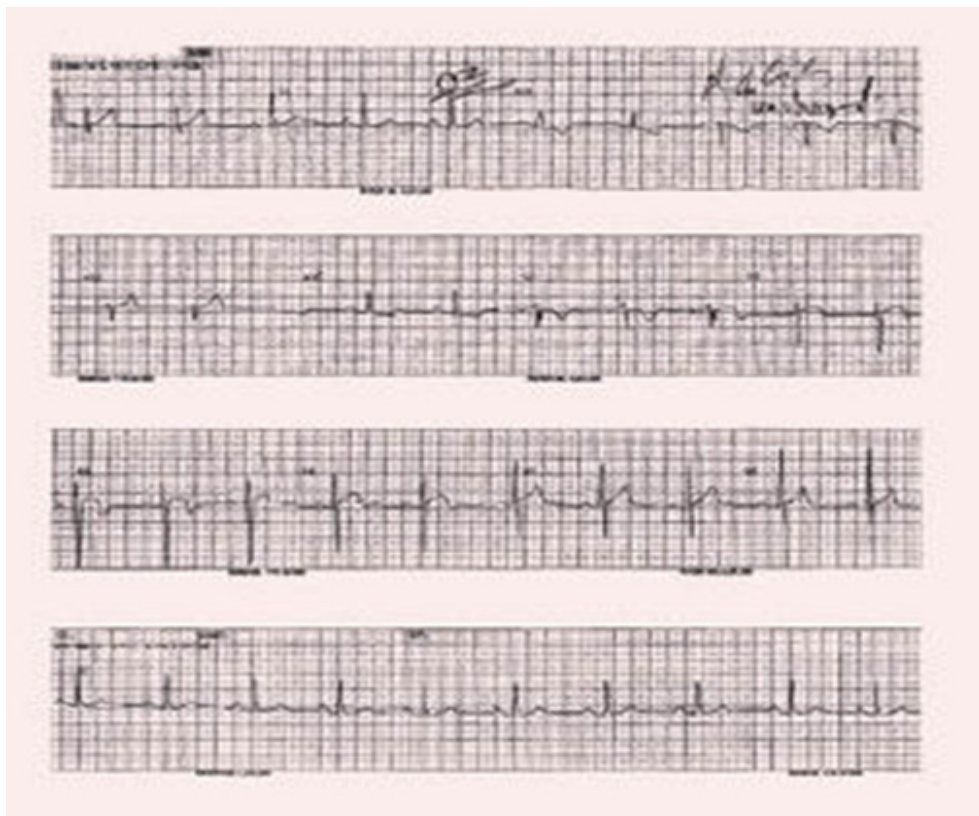
Figure 2. 12-lead ECG showing ST elevation in leads V2 and V3 with terminal T inversions