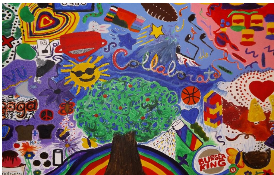
Figure 2. PSTs' thinking about education

Annually, the lead author coordinates a giant shared art piece with the exiting PSTs. Upon its completion, it is displayed in a hallway or classroom in our department as a reminder of that graduating class' thinking about education (Figure 2).