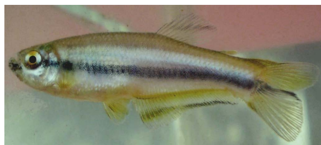
FIGURE 1. Mimagoniates barberi , ILPLA 1815, male, SL 32.4 mm, Piedras creek at the intersection with Provincial route 105, Misiones Province, Argentina.

According to Menezes and Weitzman (2009), M. barberi , M. pulcher and M. inequalis have a rudimentary caudal-fin ray pump and in this respect differ from males of their congeners which have a fully developed caudal-fin ray pump. These authors distinguish M. barberi from M. inequalis by having more branched anal fin rays (30-36