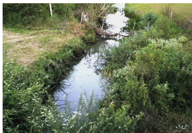
FIGURE 2. Habitat of Mimagoniates barberi , Negro creek, upper Paraná River basin, Misiones Province, Argentina.

vs. 23-30), more scales in the lateral series (41-48 vs. 34-41), fewer scale rows between dorsal-fin origin and anal-fin origin (13-15 vs. 15-18) and a black mid-lateral dark stripe in adult males (Figure 5) (vs. lateral body stripe of adult males poorly developed). Mimagoniates barberi differs from M. pulcher by the number of branched anal-fin rays (30-36 vs. 26-30) and by the absence of spines on principal caudal-fin rays (vs. presence).