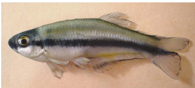
FIGURE 5. Mimagoniates barberi , MLP 9769, male, SL 33.1 mm, Negro creek at the intersection with 105 Provincial route 105, Misiones Province, Argentina.

The specimens caught by us in the Misiones rainforest were identified as M. barberi (Table 1) by their possession of a rudimentary caudal-fin ray pump, 30-31 scales in the lateral series, 15 scales rows between dorsal-fin origin and anal-fin origin, a well-defined black mid-lateral stripe in adult males and by the absence of spines on the principal caudal-fin rays.