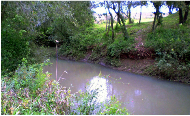
FIGURE 3. Habitat of Mimagoniates barberi , Piedras creek, upper Paraná River basin, Misiones Province, Argentina.