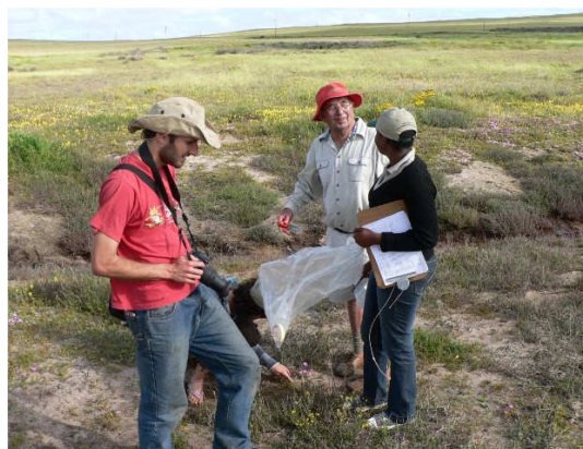
Figure 2. Custodians of Rare and Endangered Wildflowers (CREW) searching for plant species, South Africa.

Information collected by custodians (Fig. 2) has helped to prioritise species that are in need of conservation attention by playing a vital role in the determination of a species red list status. Custodians have played key roles in extending the known range, in identification and in rediscovery of species, particularly those that have not been seen in the wild for decades (Tables 1 and 2). One such example is that of the flower Wurmbea capensis , rediscovered in 2004, having previously been collected only in 1932. As of 2007 there are 12 such 'rediscovered' species. Often, findings have also led to new research, for example, field observation of populations of the very rare terrestrial orchid Corycium microglossum , has led to investigations regarding the survival of its pollinators.