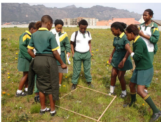
Figure 4. Students participating in Plant Monitoring Day, South Africa.

Side by side with their biodiversity monitoring activities, paraecologists are also involved in environmental awareness-raising among members of their community. Paraecologists are also active in writing and initiating newsworthy articles of relevance in their local media. Commendably, they have also been active in designing their own projects e.g. monitoring of scorpions, collection ethnobotanical information and educational story telling (Pröpper & Gruber 2007). They have also been given opportunities to present their work at regional conferences in Southern Africa. In return, their involvement in local activities has often helped communicate local community research needs and concerns to researchers.