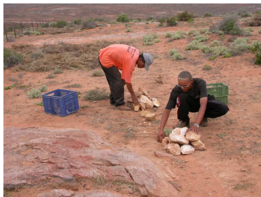
Figure 3. Paraecologists setting up a field experiment, Namibia.

Paraecologists (Fig. 3) play a key role in supporting the annual field work of researchers. Their local knowledge, supplemented by on-the job training means, they can work independently on specific tasks, with minimal quality control check by researchers. Paraecologists' routine tasks include soil sampling, annual vegetation and animal monitoring, as well as liaising with local land users. This qualified support by the paraecologists is of great importance for the pace of the annual monitoring work, which otherwise is very time consuming. Table 3 gives examples of paraecologists' activities over the last years.