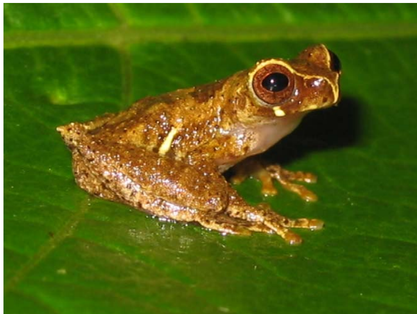
Figure 2. Dendropsophus ruschii , adult male from Fazenda Floresta, municipality of Pedra Dourada, state of Minas Gerais, Brasil.