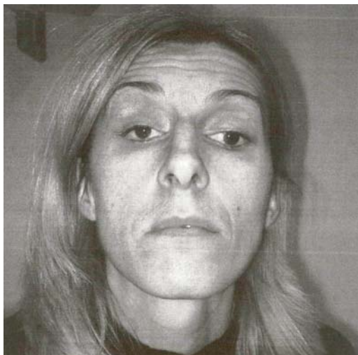
Fig. 1 – Thirty years after the surgery

Case 1 – a 38-year-old woman with strabismus and bilateral ptosis which had caused a moderate chin elevation (Figure 1), otherwise healthy, was referred for the evaluation