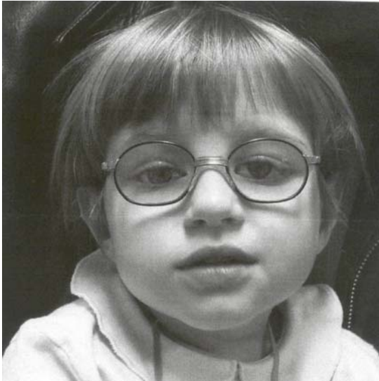
Fig. 4 – Four years after the surgery

after the surgery (Figure 4) she assumed a nearly normal head posture with residual small right exotropia of 5 PD and 7 PD of hypotropia. Elevation was also absent, eye movements limited, particularly adduction and more RE, but the upward convergence seemed unnoticeable. With prolonged treatment with artificial tears (0.3% preservative free HPMC sid and HPMC 2% once at bedtime) after the ptosis surgery her corneas are tolerating the exposure well, with just a mild occasional superficial punctate keratopathy of RE, without the signs of stromal lysis or scar formation in the cornea.