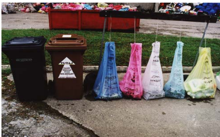
Fig. 1. Bin bags and containers used for the selective collection of municipal waste in the area of activity of „Beskid” Company (white – white glass, green – mixed glass, blue – paper and textiles, red tins and metals)

Objects of the waste management consist of: 1 – collecting station, 2 – landfill site, 3 – mixed waste utilization plant. To encourage people to segregate waste at its beginning, 2 years promotion has been brought into action. Costs of disposing waste and bin bags were paid by local authorities in Żywiec, householders pay only a fee for disposing and collecting ballasts wastes. Such promotion is applied now and concerns the municipal waste (Fig. 1), ( www.beskid-eko.pl , 2005)