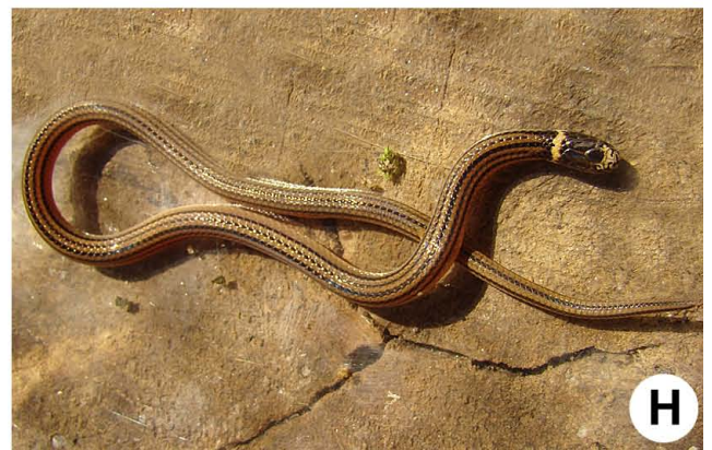
FIGURE 3. Specimens from Parque Natural Municipal da Taquara: A - Boa constrictor ; B - Chironius bicarinatus ; C - Chironius fuscus ; D - Chironius exoletus ; E - Pseustes sulphureus ; F - Spilotes pullatus ; G - Echinanthera cephalostriata ; H - Elapomorphus quinquelineatus .