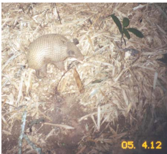
Figure 5. Cabassous tatouay captured by camera trap.