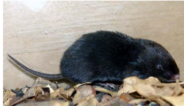
Figure 4. Blarinomys breviceps .

We confirmed the presence of Puma concolor (Linnaeus, 1771) from a posterior member footprint found in the margin of one track. The footprint measures were 5.98 cm (total width) and 5.16 cm (total length). These results are in concordance with those proposed by Oliveira and Cassaro (2005) for this specie. P. concolor has a broad geographical distribution (Mazzolli 1993). This top predator may have important role in regulating its prey populations (Hairston et al. 1960, Terborgh et al. 2001).