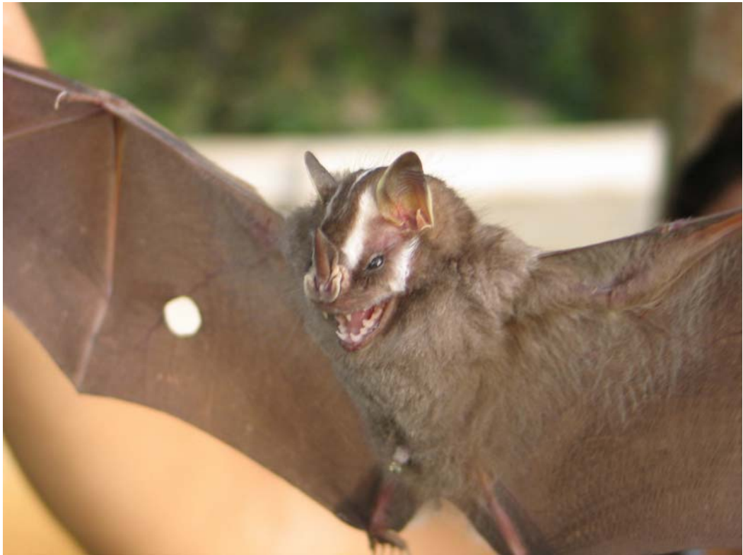
Figure 7. Platyrrhinus recifinus .