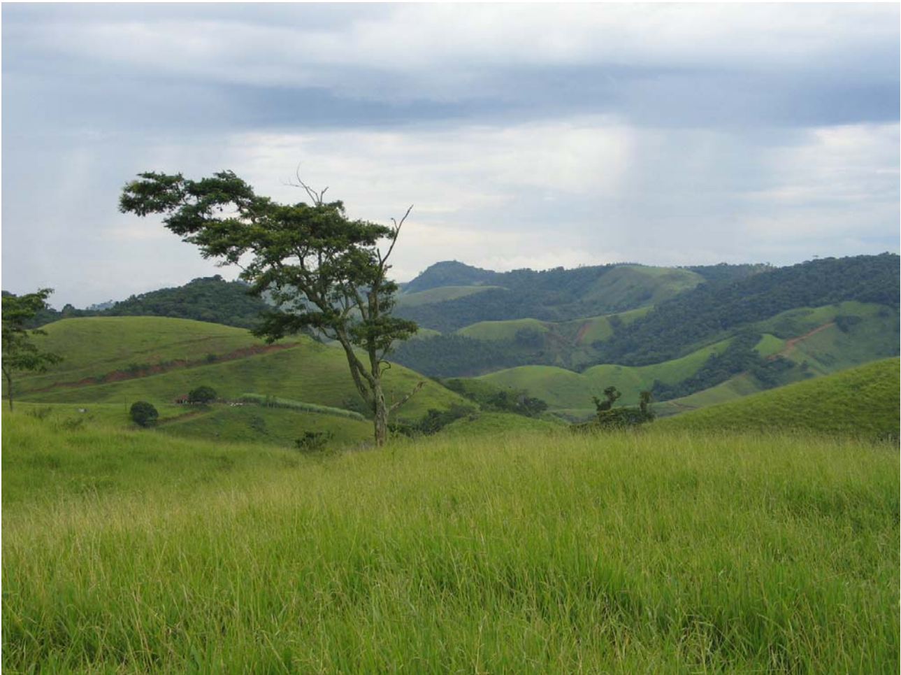
Figure 2. Serra da Concórdia landscape.

also surveyed in pitfall traps, using 30 buckets of 30 liters divided in three different systems, each one consisting of 10 buckets, 5 m apart from the next one and connected with a drift fence, totalizing an effort of 180 buckets/night.