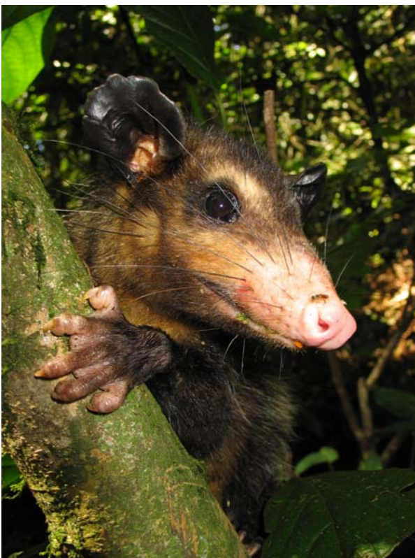
Figure 3. Didelphis aurita .

We recorded 37 mammal species, 22.3 % of the total of 166 terrestrial mammal species known to inhabit the state of Rio de Janeiro (Rocha et al. 2004). Of these, five are endemic to the Atlantic Forest: Didelphis aurita (Wied, 1826) (Figure 3), Marmosops incanus (Lund, 1840), Philander frenatus (Linnaeus, 1758), Blarinomys breviceps (Winge, 1887) (Figure 4), and Trinomys gratosus bonafidei (Moojen, 1948) (Costa et al. 2007; Fonseca et al. 1996; Pessôa and Reis 1992). This last species is also endemic to the state of Rio de Janeiro (Pessôa and Reis 1992) and its distribution area has been amplified in the present study. Eight species are in the list of threatened species of the state and three are in the Brazilian list (Bergallo et al. 2000; Machado et al. 2005).