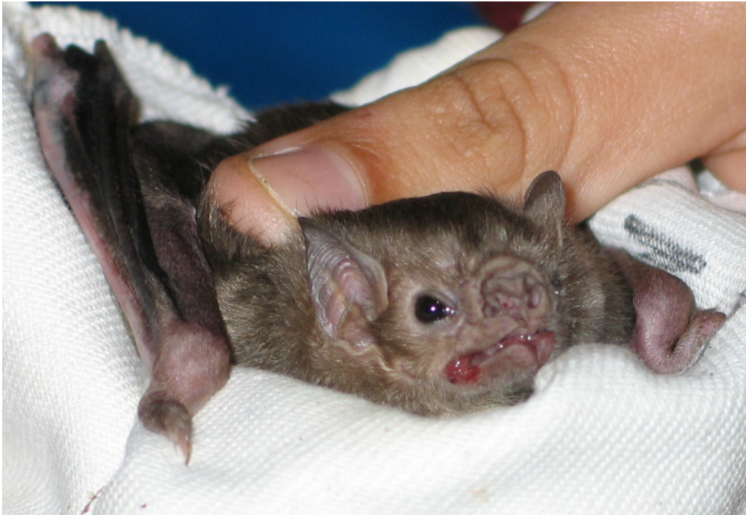
Figure 6. Diaemus youngi .