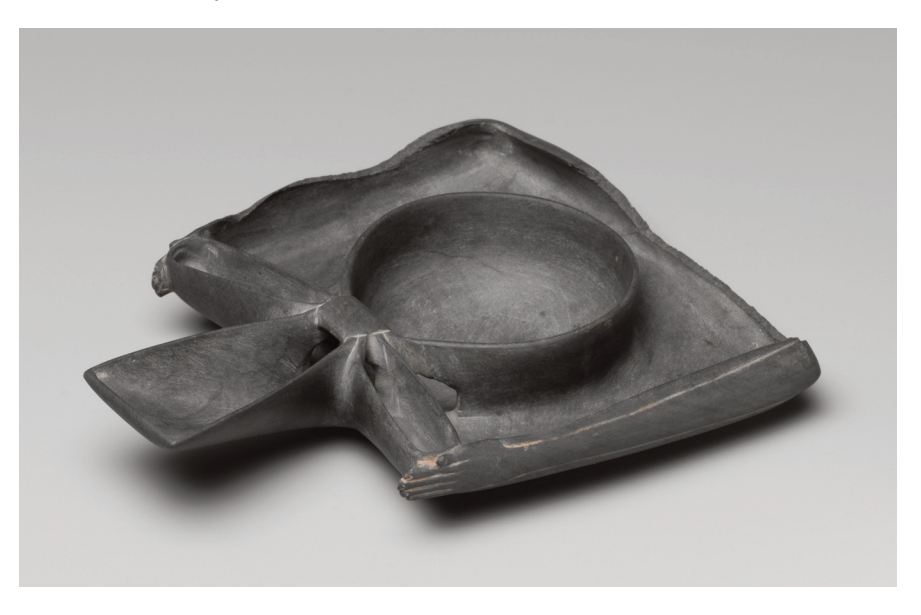
FIGURE 1: Libation dish, 19.2.16, Metropolitan Museum of Art (New York). https://www.metmuseum.org/art/collection/search/543866 (accessed 30 October 2017).

in these examples, it is tempting to speculate about the role that naming practices may have played in the process.<sup>101</sup> The recurrence of the names through generations within a family causes the ancestors to be ever present in the daily life of a social group, and perhaps to strengthen the sense of belonging to that group. Mark Smith has metaphorically referred to names as a kind of "genetic material" that is transmitted over generations. 102 It is striking that he uses the same biological image previously employed by Schneider to describe blood in his study of American kinship. If this view is correct, names could be embodying the ka of the family, which acts as a transmissible substance that creates a common background among people. The ka was indeed sometimes mentioned in close association with the name, as in Pyramid Text Utterance 469: NN-pn wd3 hn^c iwf = f nrf n NN-pn hn^c rn = f^c nh NN-pn hn^c k^2 = f, "NN is complete with his flesh, it is good for NN with his name, NN lives with his ka."103 Since the Twentysecond Dynasty, and more frequently in the Greco-Roman period, the ka acquires the meaning of "name," 104 possibly as a testimony to this intertwining between different aspects of the social persona of the individual. However, whether this semantic drift is evidence of an actual identification of ka and name in later times or a simple change in usage reflecting a shift in the understanding of the ka is difficult to determine.