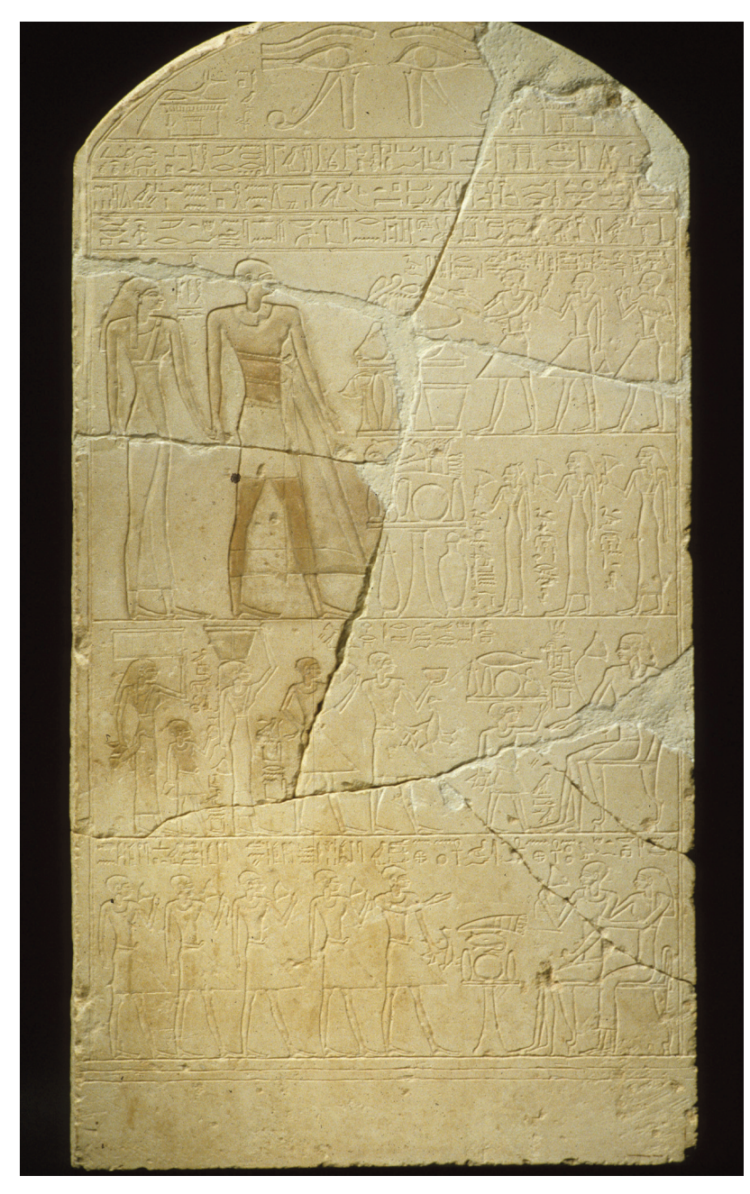
FIGURE 3: Figure 3: Stela of Reniseneb, 63.154, Metropolitan Museum of Art (New York). https://www.metmuseum.org/art/collection/search/545503 (accessed 30–Oct–2017).

the dead. These types of documents are known since the late Old Kingdom, and in them living members of the kin group would ask their ancestors to intercede in ordinary matters regarding inheritance, health, or fertility. This highlights their role as carers and protectors of the kin group, and places them at