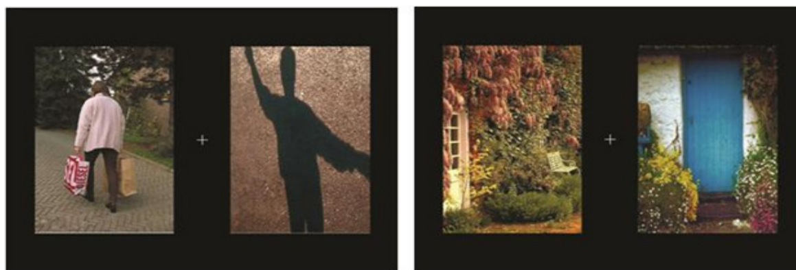
Figure 1. Two samples of study slides. (a): Painful-neutral; (b): Neutral-neutral

For the total number of fixations, there was a significant main effect of picture type (F 1,36 =69.47, P<0.0001, η 2 =0.65) with most of fixations occurring on the painful images in both groups (painful: Mean=69.65, SD=15.99; neutral: Mean=47.76, SD=10.59). The main effect of group (F 1,36 =2.80, P=0.1) and the group×stimuli interaction (F 1,36 =0.09, P=0.76) were not significant. For duration of first fixations, there were no significant main effects for stimuli (F 1,36 =0.43, P=0.51), group (F 1,36 =2.95, P=0.09] and the interaction effect (F 1,36 =2.87, P=0.09). Regarding the total duration of fixations there were no significant main effects for stimuli (F 1,36 =3.20, P=0.08, η 2 =0.08), group (F 1,36 =0.614, P=0.439) and the interaction effect (F 1,36 =0.635, P=0.431).