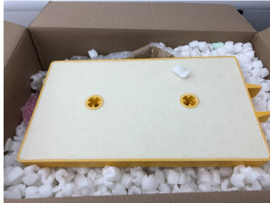
Fig. 4. Covered PCB of an industrial IoT device

Secure Boot and SELinux The Echo Plus is an example of an IoT device with stronger security measures compared to most other devices. Through the use of Android, trusted boot and SELinux, even though the firmware can be extracted, obtaining root access is difficult compared to other devices. It appears that SELinux, which is often considered hard to properly configure for a desktop system, might be suitable for IoT devices, which usually only provide limited and defined functionality. This is especially in light of the worrying practice to run all services with root permissions, which we encountered on many IoT devices. In addition, techniques to cryptographically verify the filesystem (e.g. dm-verity ) or possibly also firmware encryption (if supported by the underlying processor, see e.g. [37]) should be considered for future IoT devices.