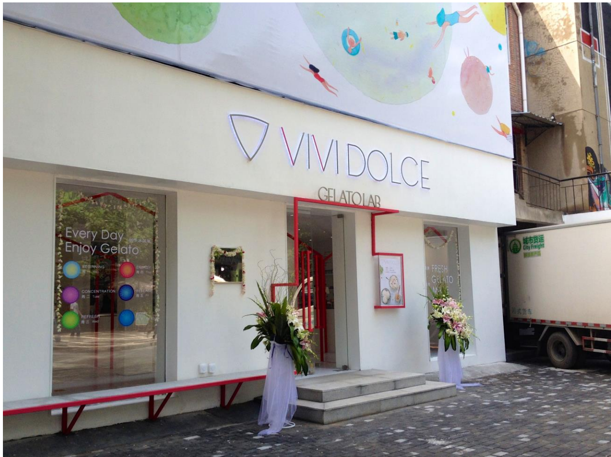
Figure 1 Commercial uses have arguably been increasing over the years in 798 arts district. Pictured here is a “Gelato Lab” opened in the arts district in August 2015

Data collected for this study might help shed some light on this ongoing debate between members of the arts community in 798 on one side and the district government and factory managers on the other side. Different from the categorization adopted by managers of 798, I distinguish art galleries/institutions/centers from other businesses or organizations that undertake “cultural and creative industries”. My reason is based on that almost all artists and gallery owners that I talked to view these other “cultural” businesses as “commercial uses”. Such businesses include companies that engage in industries such as advertisement, media, design, architecture, and commercial photography and filming. I include art bookstores and art supplies stores, however, in art-related uses for they are important components of arts communities. My compiled (incomplete) lists show that there were 140 and 121 art-related uses in 2008 and 2013 respectively, and 175 art-related uses and 316 not-art-related uses in 2015 in 798 arts districts