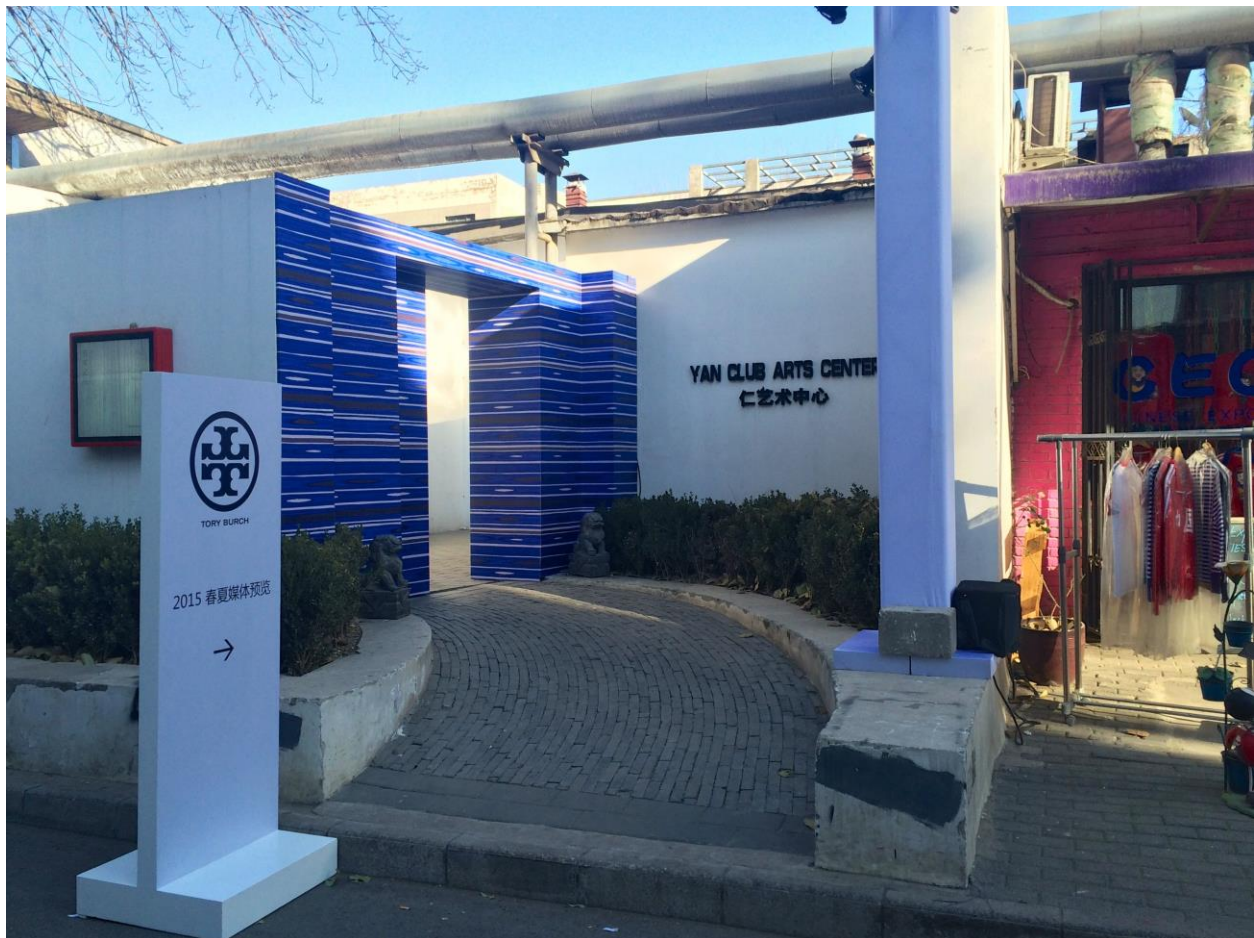
Figure 3 An arts center in 798 was used for a fashion event

In response to the pressure of rising rent, some artists and galleries take advantage of the popularity of 798 and develop side-businesses to bring in extra revenue. These businesses might be as small as selling postcards and souvenirs and opening cafés in galleries, and as big as renting out their spaces temporarily for commercial campaigns and events (see Figure 3; interview with staff of a commercial gallery, A-6). However, consequently, these artists and galleries contribute to and become part of the commercialization process taking place in 798.