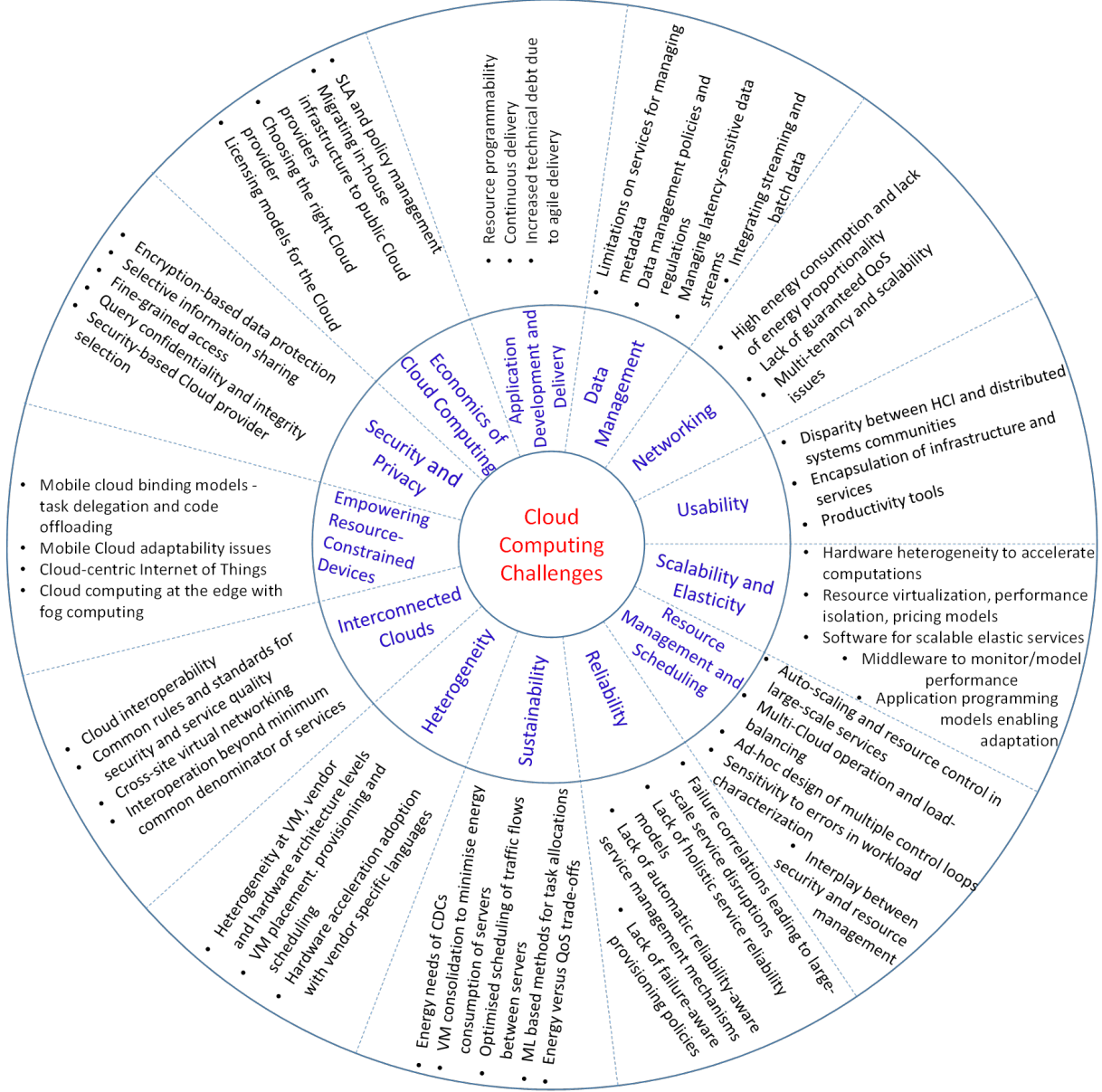
Figure 2: Cloud computing challenges, state-of-the-art and open issues