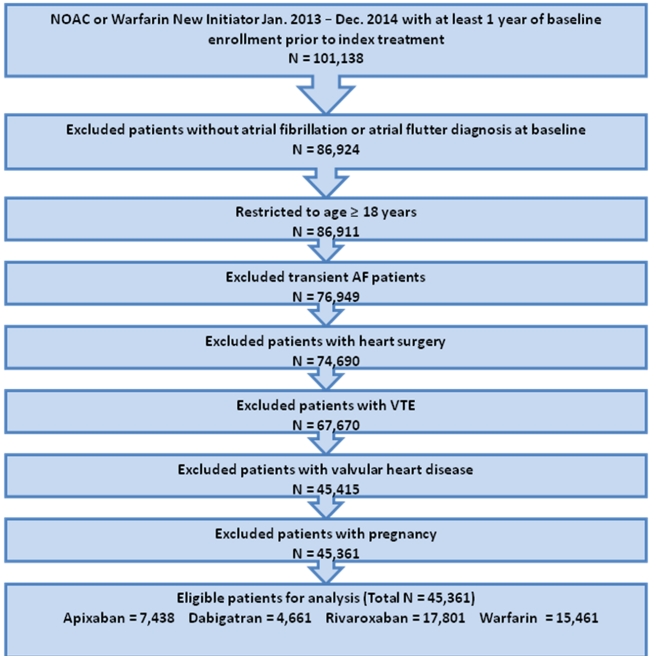
Fig 2. Patient selection criteria. Study population flow chart with inclusion and exclusion criteria used to select 45,361 patients. NOAC: non-vitamin K antagonist oral anticoagulant; VTE: venous thromboembolism.

https://doi.org/10.1371/journal.pone.0195950.g002