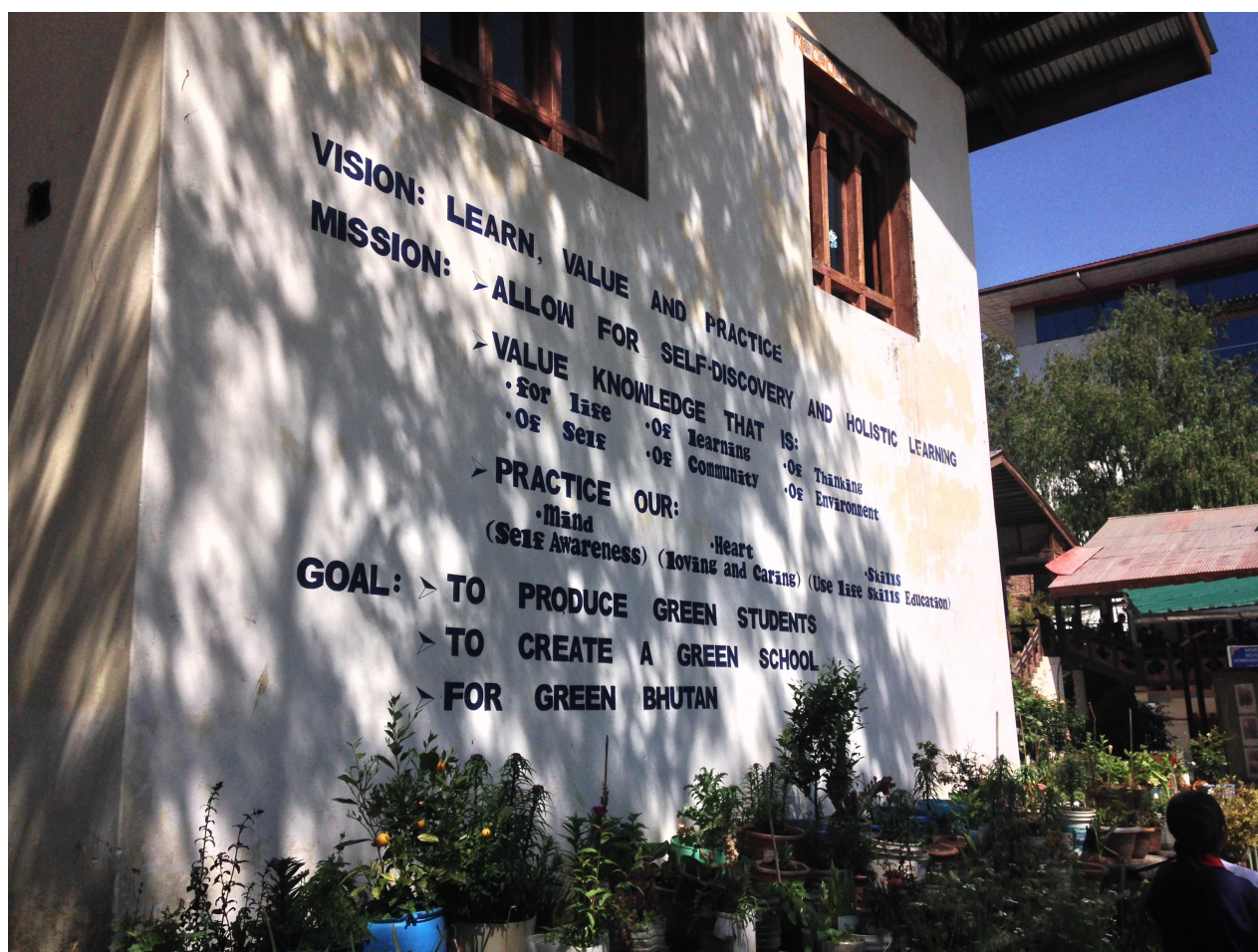
Photo: Vision, Mission, and Goal statements on a school building in Bhutan; reflecting the philosophy of this school's leadership.