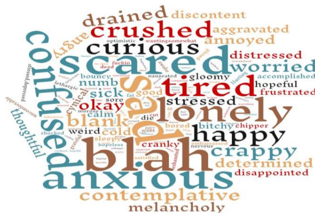
Figure 4. Word cloud for moods of depressive posts.

The post classification and community classification results from Tables 4, 5, and 6 demonstrate the promise of the proposed method which provided a high degree of precision, recall, and accuracy. These results show that the ratio of misclassification for depressive posts and depressive communities is lower in comparison to misclassified non-depressive posts and non-depressive communities, respectively. This is due to the reason that depressive communities mostly contain posts relevant to depression. However, non-depressive community users discuss various aspects of life and sometimes express their feelings of depression and thus potentially making the post a candidate for depressive class. The classification of such outliers is indeed a big challenge. Based on passive writing style and sentiments of these apparently non-depressive posts from non-depressive communities, the classifier labelled them as depressive posts that contradicted with the ground truth of the dataset.