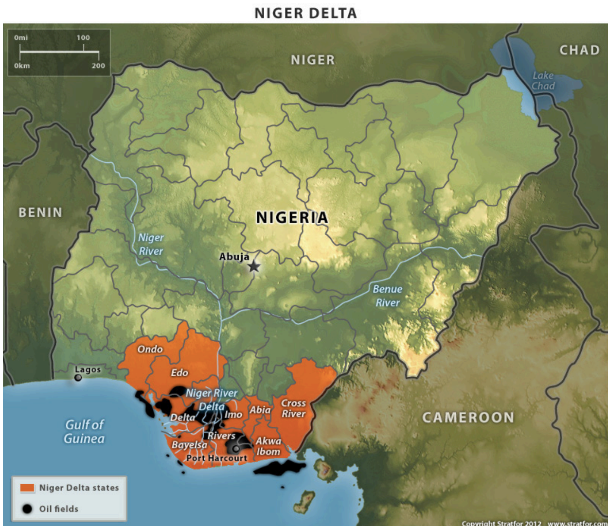
Figure 1: The location of oil fields in Nigeria, as of September 2012