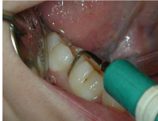
Figure 1. Clinical use of ultrasonic scaler

The ultrasonic instruments used in dentistry work at frequencies of 25 to 40 kHz. They were first introduced as a drill but then adapted as a scaling instrument used to clean deposits from the teeth (Lea and Walmsley, 2009). Such deposits are comprised of bacterial biofilms, which may or not be calcified. The vibrations transferred to a steel probe are used to physically remove them from the tooth. Such action also has the potential to damage tooth structure if the instrument is not used correctly. The instruments present as either a magnetostrictive or piezoelectric generator with a series of interchangeable probes fashioned in the form of dental hand instrument. It is the working tip that is used to remove the deposits from the tooth. The shapes of the probes are often curved which allows the working tip to negotiate difficult to reach places around or inside the tooth.