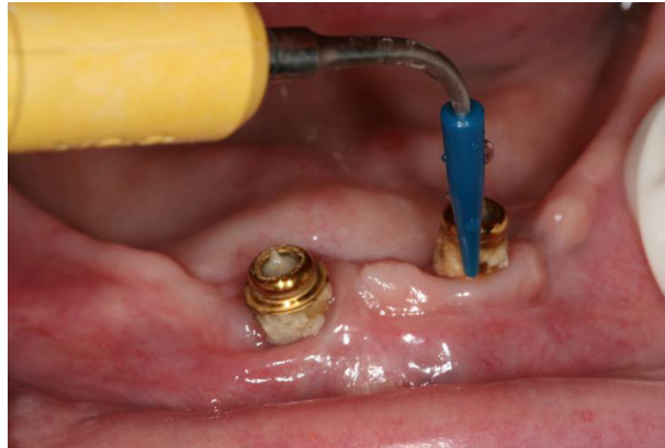
Figure 4. A plastic covered metal ultrasonic probe being used to clean titanium dental implants