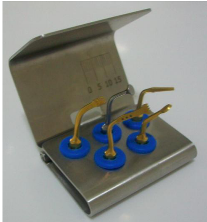
Figure 5. A plastic covered metal ultrasonic probe being used to clean

This area of ultrasonics use merits further investigation as further research is required to look at the temperature changes during cutting, alterations to the organic/inorganic components within the bone, changes to osteoblast viability/vitality and quantity/quality of debris produced.