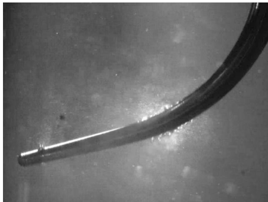
Figure 2. A frame from a video showing intense activity at the bend of the probe with some bubble formation near to the tip of the instrument.

The working ultrasonic scaler generates biophysical forces around the oscillating tip (Figure 2) which have the potential to be bactericidal. The phenomenon of cavitation results when the water supply meets the vibrating tip and forms minute bubbles (Lea et al., 2005). The bubbles grow in size, then collapse inward (implode), releasing a burst of energy.