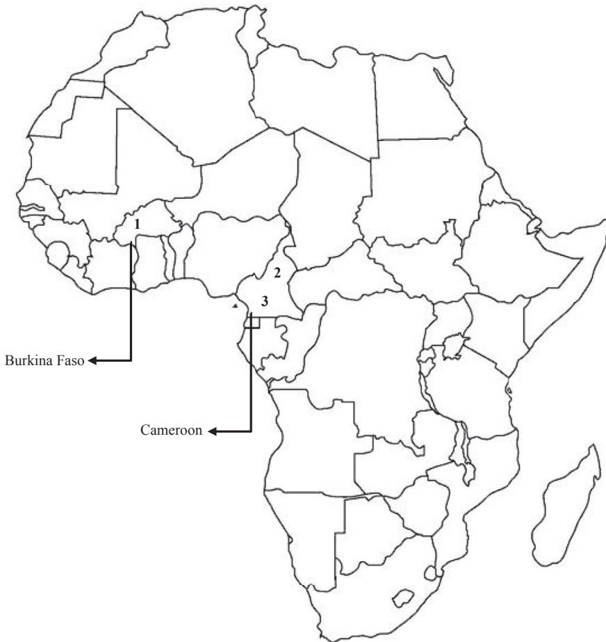
Fig. 1. African map showing the investigated countries and cities. 1: Ouagadougou; 2: Ngaoundere; and 3: Yaounde.