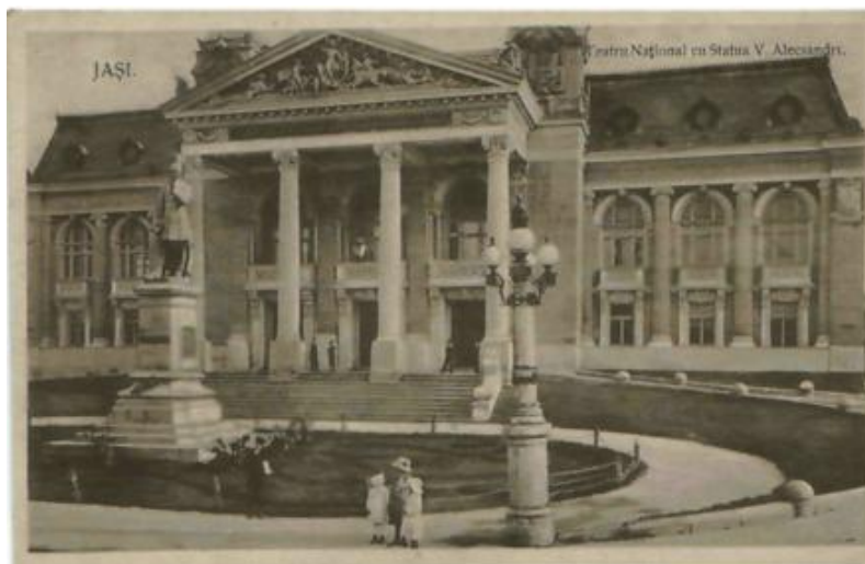
Fig. 1. – V. Alecsandri Theatre, Jassy.