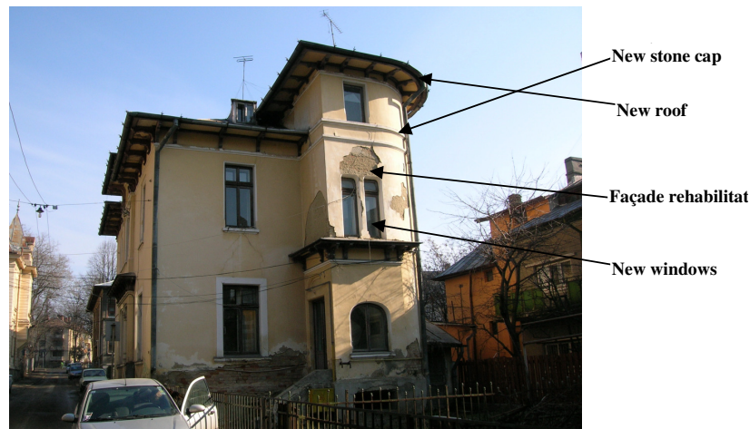
Fig. 3. – Building rehabilitation (Jassy, 2008).

The objective of the control inspection is to provide a baseline for a successful maintenance plan. The control inspection should describe the items of work in detail and assign them priorities (Figs. 3 and 4). Historic facilities, if they are properly maintained, should cyclically cost no more per year of life than non-historic facilities.