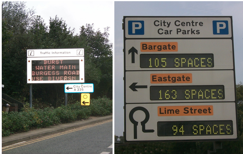
Figure 2: Variable message sign and Parking guidance information in Southampton