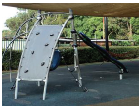
FIGURE 3: Playground in Park B. The gated and shaded playground featured more traditional style equipment on a soft-fall surface.

or care givers (hereafter referred to as parents) in intervention and comparison parks in May 2007 prior to the upgrade, and nine months after the upgrade completed in May 2009. The study was approved by the University of Sydney Ethics Committee (Ref. no. 04-2007/9905).