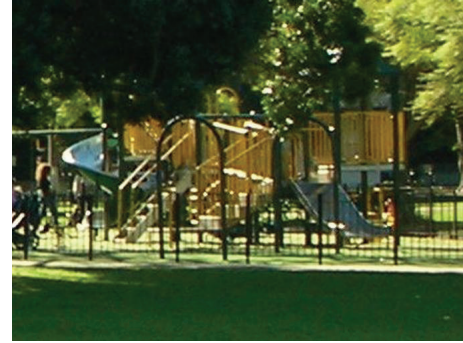
FIGURE 1: Playground in Park A, prerenovation. The gated playground included a large multifunction apparatus on soft-fall flooring in a gated area in the middle of the park.

2.1. Study Setting. The intervention Park A for this study is located in a lower socioeconomic urban neighborhood within the city of Sydney, the council responsible for the central Sydney areas. The comparison park (Park B) was chosen for its similarities to Park A and is located in a nearby urban neighborhood within the city of Sydney. These similarly sized parks each included a playground, a large open area, and a sports field; several small “standalone” playgrounds can be found within a short walk of each of these parks. The neighborhood population of Park B is generally socioeconomically similar to Park A (e.g., percent population identified as Indigenous) though it has a higher employment rate and a higher proportion of English-only speaking households [35, 36].