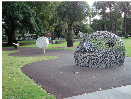
FIGURE 2: Playground in Park A, postrenovation. Play sculptures on soft-fall flooring were installed in an open area.