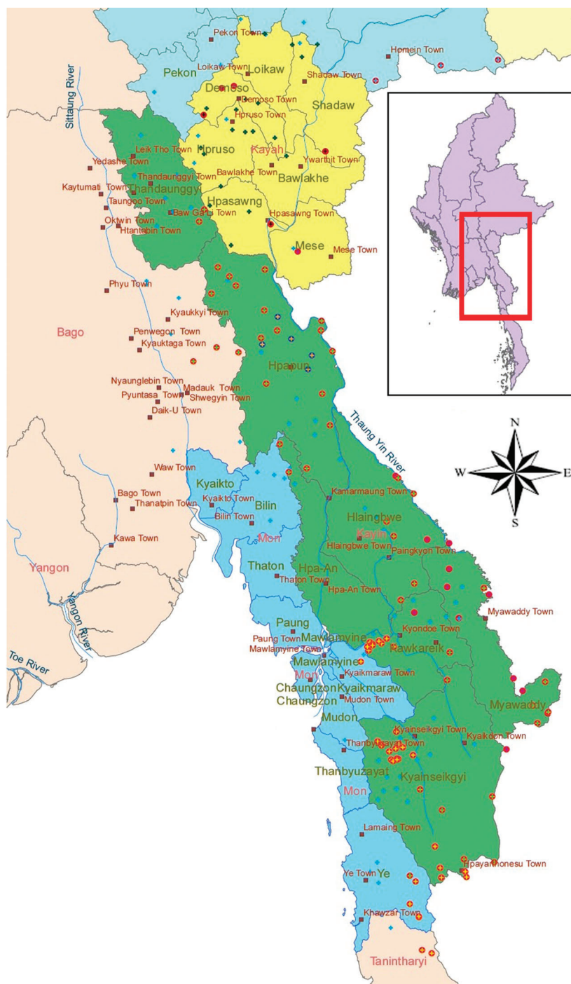
Fig. 2. Study area of ethnic townships.

which reflected the development of the HRH and were easily accessible. Ten informal context interviews were conducted with clinic-in-charges during their biannual meeting in Mae Sot. Interviews were facilitated by three health information system (HIS) staff. The initial draft of this article was forwarded for review and feedback by the five EHO and CBHO leaders who were integrally involved in the HRH development through policy, planning, or