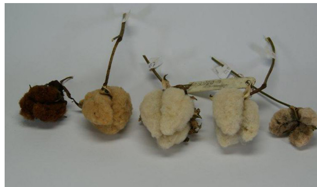
Figure 1. Accessions of Gossypium barbadense used with different fiber colors, from left to right: chocolate brown, orangish (PI 608352), yellowish (PI 528086), grayish (PI 435267), dark brown (PI 435250).

Table 1 contains the results of the cross between the accession PI 608352 of G. barbadense of orangish fiber (Figure 1) and the cultivar of G. hirsutum , BRS Aroeira, with white fiber. The fiber of the F 1 generation had an intermediate color, with the orangish color (Figure 1) partially dominant over white. The F 2 generation showed plant segregation of colored fiber and white fiber well fitted to the expected 3:1 proportion according to the \chi^2 test with a probability of occurrence of 0.50-0.70. The backcross with the white fiber progenitor BRS Aroeira showed segregation of 1:1 of plants