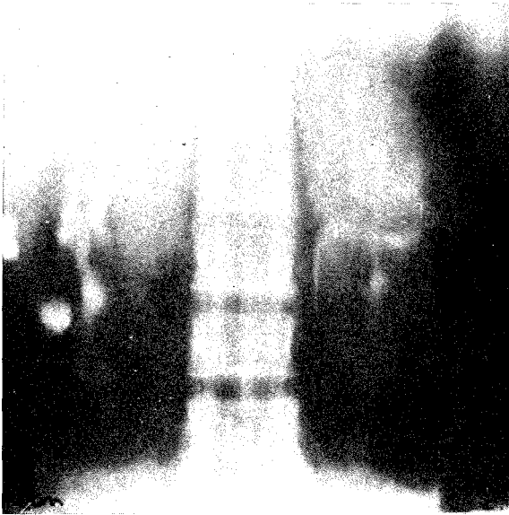
Fig. 1 Bilateral large kidneys with calyceal displacement and distortion by relatively radiolucent renal masses.

of the shaft of the left second metacarpal, the right second and third metacarpals and the proximal phalanges of the right index, middle and little fingers.