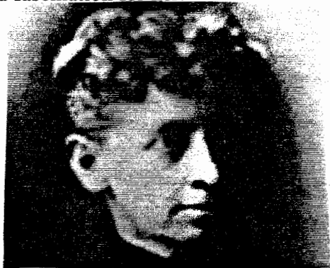
Ellen Browning Scripps at age 18