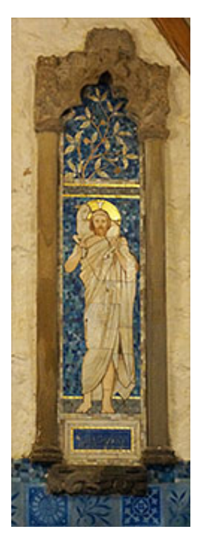
Figure 6. Chancel niche, Llanbadrig.

The supposition that a niche in the church once held a statue of Patrick is consistent with the iconography of the medieval carved stone. In addition to the ballflower, it presents serpentine coils, with a snake's head in the upper left corner. It is a reflection of hagiography about Patrick's expulsion of reptiles from Ireland and other islands, found in sources such as Jocelin's vita (Figures 6 and 7). In respect to the dedication, the 1937 Royal Commission volume lists the church as "Parish Church of St. Patrick" (1937/1968: 36). The most recent archaeological scholarship adds to the continuity of that reporting, stating that "[t]he dedication to St Patrick is noteworthy..." (Edwards 2013: 157).