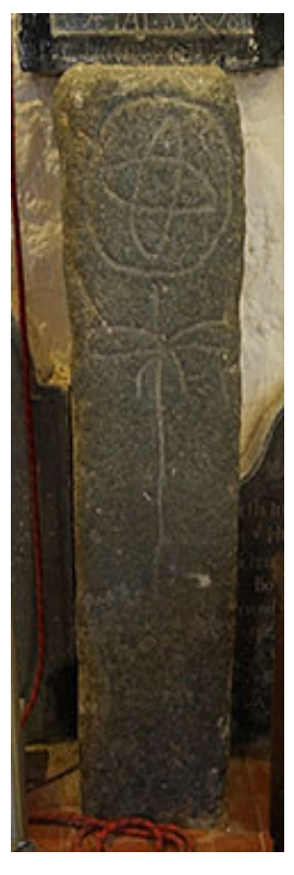
Figure 4. Stone pillar, Llanbadrig.

The church itself is a Grade II* listed building, a structure built of "rubble stonework" and "a variety of mortars" (Voelcker 2012: n.p.). The chancel is unusual in that it is longer and wider than the nave; the assumption is that the church was extended at some time. The baptismal font is of the twelfth century, and the nave and chancel arch are tentatively dated to the fourteenth (Royal Commission 1937/1968: 36). There is also a medieval carved stone at the base of a narrow, perpendicular canopy or niche set in the east wall, to the observer's