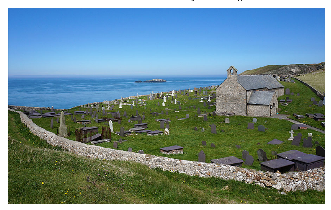
Figure 1. Llanbadrig church and churchyard.

The evaluation of the contested Llanbadrig dedication involves a choice of perspectives. As a geographer, Graham Jones has defined the cultural phenomenon of dedication: