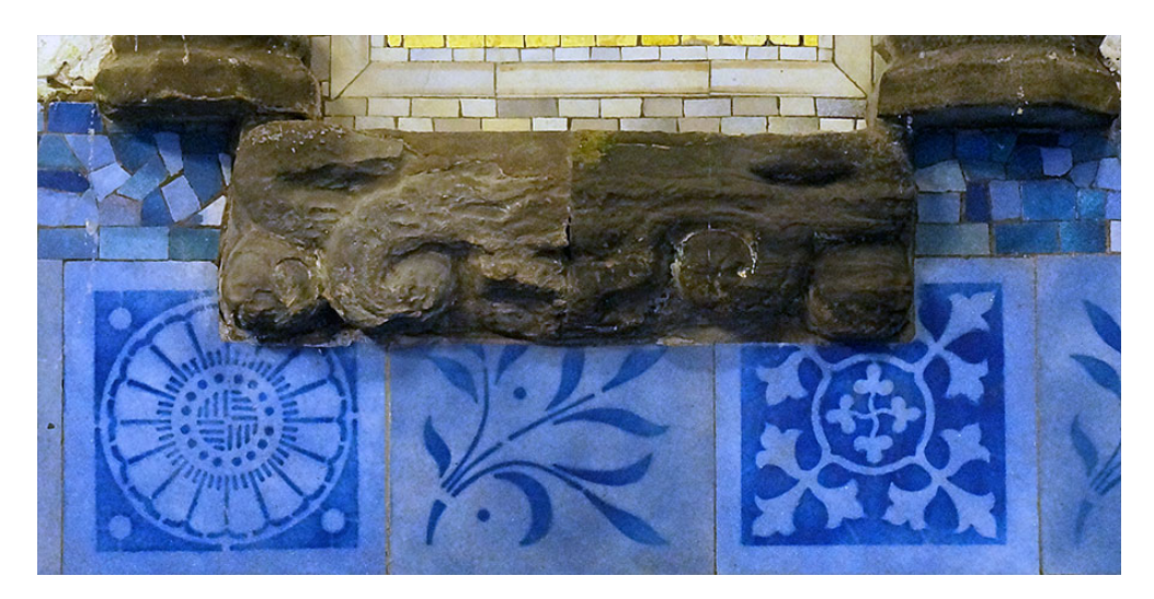
Figure 7. Carved stone, Llanbadrig.

Patrician iconography is repeated in a fuller form elsewhere in Anglesey. The church of St Mary and St Nicholas, Beaumaris, contains an elaborate alabaster tomb with a depiction of Patrick. The four sides of the tomb are carved with a number of representations of saints and bishops. The figures of the bishops tend to be quite standardized, with ecclesiastical status indicated by the mitre, staff, and right hand raised in blessing. That of Patrick is unique in that