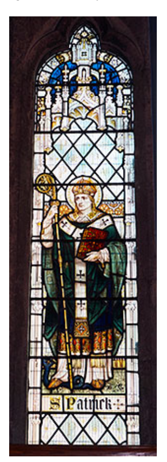
Figure 9. Window, St Padrig (New).