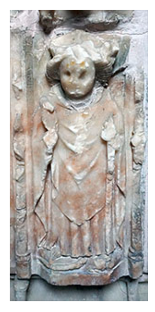
Figure 8. Carved figure, Bulkeley tomb.

Llanbadrig's survival as a place indicates a location of marked significance to the communities it has served. We cannot be sure when that existence began. Nevertheless, physical landmarks function as mnemonic devices. Such a place would be more likely to be associated with remembered information, such as a dedication, versus a site with a more tenuous existence. Neither is there an identifiable point when Llanbadrig appears to have fallen into extended disuse, another of the situations in which a dedication may be lost or changed.<sup>22</sup>