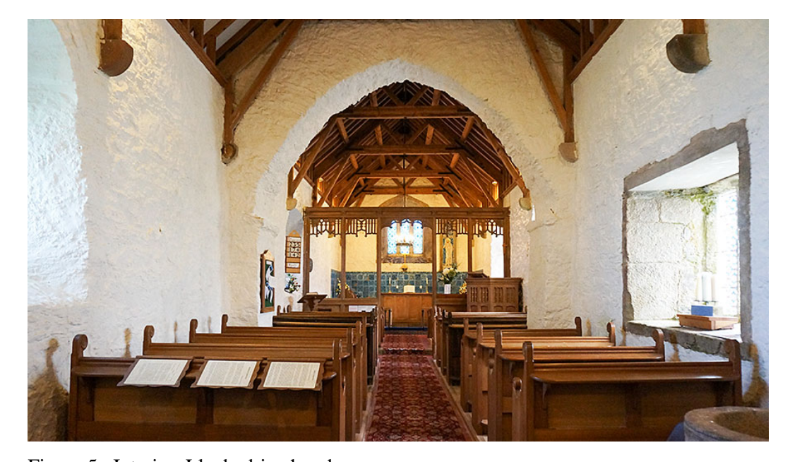
Figure 5. Interior, Llanbadrig church.

right of the altar. The use of ballflower in the carving places the work in the first quarter of the fourteenth century (Royal Commission 1937/1968: 36, 151) (Figure 5). 19