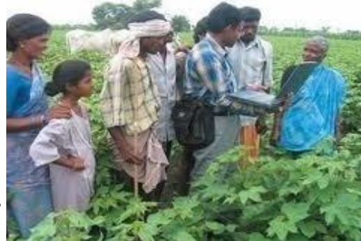
Figure 1: IT-based Agro-advisory system