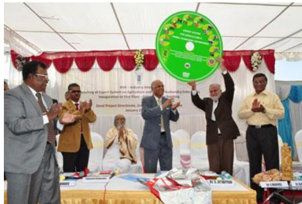
Figure 2: Expert system on Agriculture

Maintaining email servers, web-servers, Local Area Networks (LAN) has become big problem for most of the institutions under NARS in view of ever increasing and technologically challenging security threats viz. computer viruses, spam, phishing attacks, cyber crimes and so on. The highly skilled manpower required to maintain ICT systems cannot be recruited and retained in NARS due to several fold salary differences between public research organization and private ICT organizations. Therefore, the best option is to create integrated professionally managed ICT facilities, securely accessible to all institutions under NARS. A National Agriculture Research Data-Center with supercomputing facility which can provide safe access to members of NARS