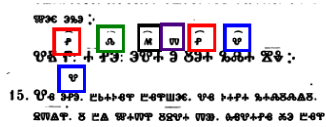
Figure 6: Combining Glagolitic Letters Vede (boxed in blue); Dobro (boxed in green); Djervi (boxed in black); Nashi (boxed in red); and Tvrido (boxed in indigo).