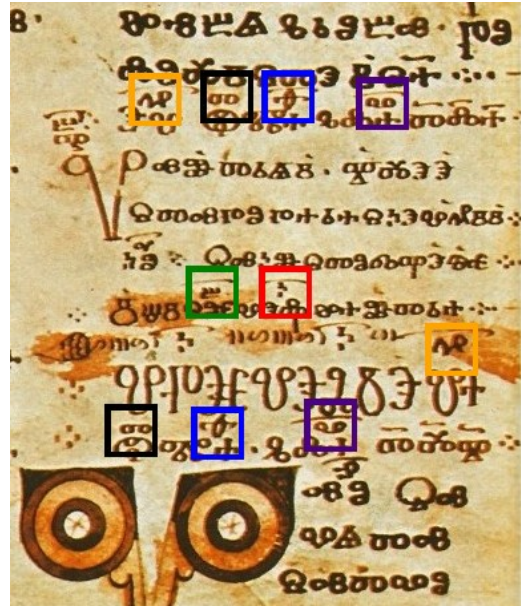
Figure 11: Combining Glagolitic Letters Buky (boxed in green); Vedi (boxed in indigo); Djervi (boxed in orange); Kako (boxed in red); Tvrido (boxed in black); and Fita (boxed in blue).