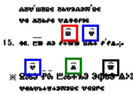
Figure 7: Combining Glagolitic Letters Vede (boxed in blue); Zhivete (boxed in green); Myslite (boxed in black); and Sha (boxed in red).