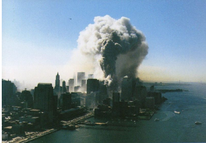
Figure 5: The destruction of the North Tower creates a “mushroom cloud” effect. Image courtesy of the New York City Police Foundation (Sweet, 2002: 20)