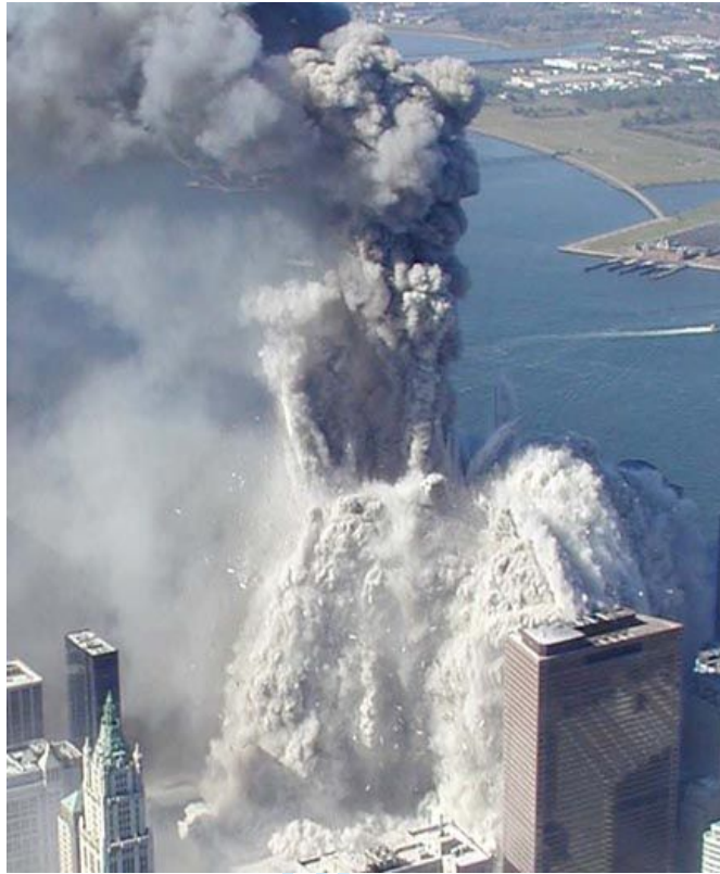
Figure 2: WTC 1 is mostly turned to dust in mid air

1 2 3 4 5 6 7 8 9 10 11 12 13 14 15 16 17 18 19 20 21 22 23 24 25 26 27 28 29 30 31 32 33 34 35 36 37 38 39 40 41 42 43 44 45 46 47 48 49 50 51 52 53 54 55 56 57 58 59 60