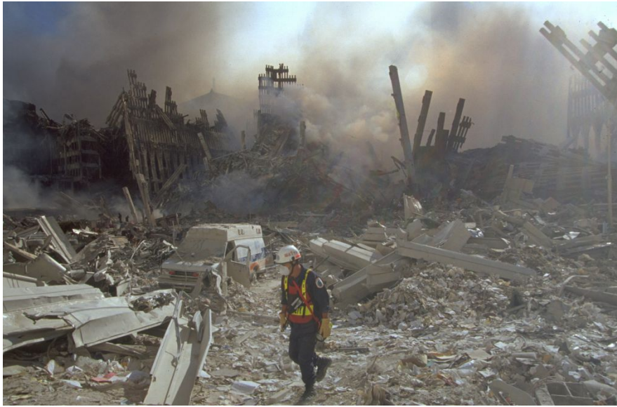
Figure 1: Debris at ground level immediately after the destruction of the Twin Towers.