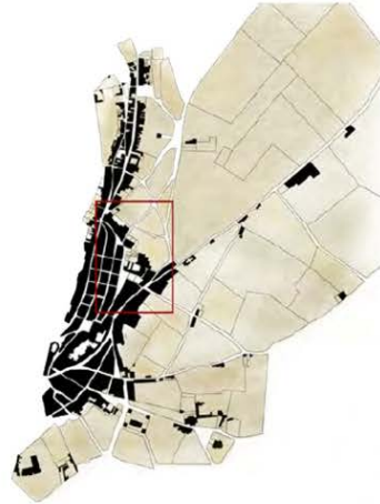
1850-1900: Dismissal of the city walls and urban development along the main roads