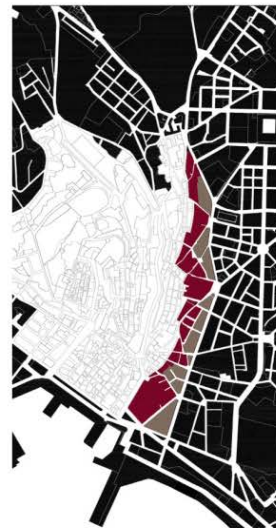
1950-2000: De-industrialisation leaves spaces and buildings in need of recovery (in light grey)