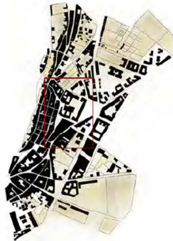
1943: Factories and residences that took the place of open fields, are damaged by the bombing