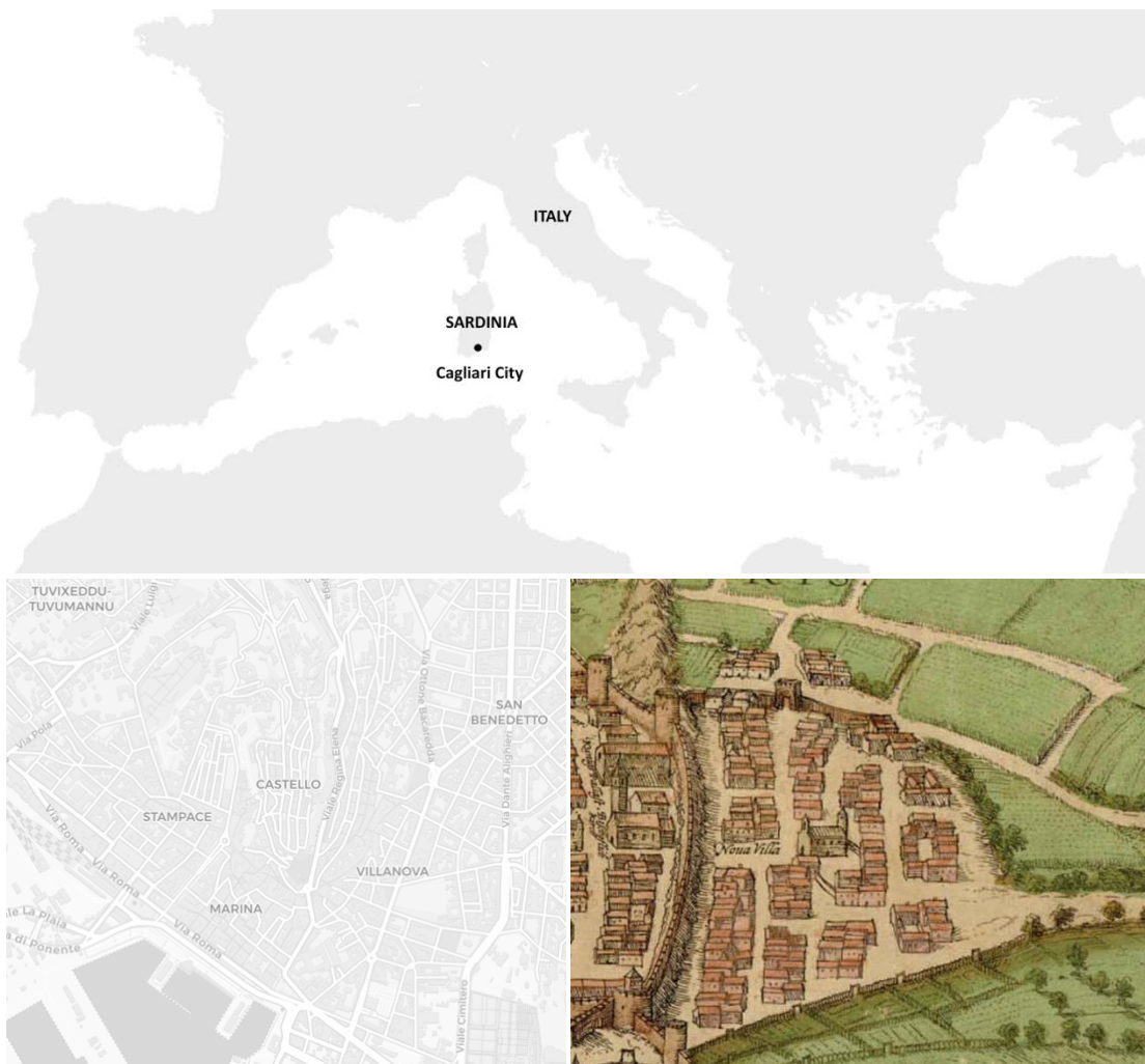
Figure 1: Cagliari City - the geographical context, a view of the city centre and a view of Villanova District in the Cosmographia Universalis by Sebastian Münster (1550)

To sum up, the renovation interventions modified the historic identity of Villanova, leading to a “hybrid” district, where residents, new inhabitants and migrants, luxury boutiques and old shops coexist with some conflicts. This is an example of incomplete or still ongoing gentrification and, therefore, it may help study the role played by architects and planners for the creative and cultural transformation of the historical buildings, unlike the other historic districts of Cagliari. For this reason, Villanova has been chosen as a case study for this research.