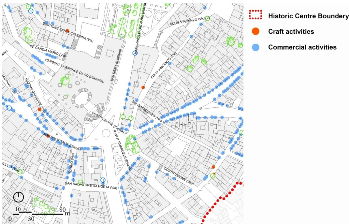
Figure 4: Map of the commercial businesses as of 2015 in the Detailed Plan for the City Centre. Considering the business locations, the map shows a different picture of Via Sulis compared to Figure 3