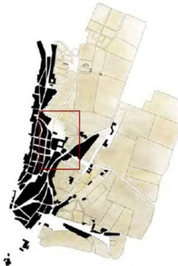
1800-1850: Villanova district and San Domenico complex (in the red rectangle)