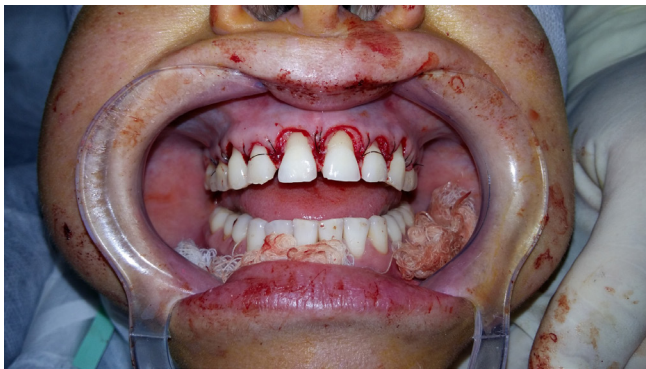
Figure 10 - Continuous suture