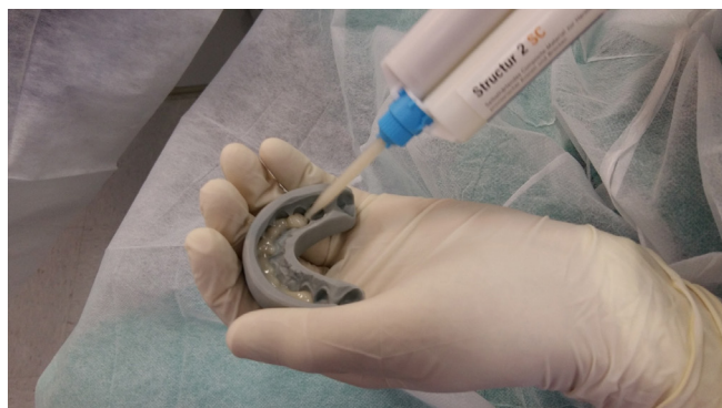
Figure 3 - Filling of the silicon wall with bisacrylic resin