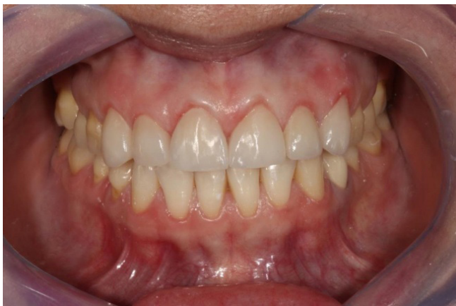
Figure 11 - Final image