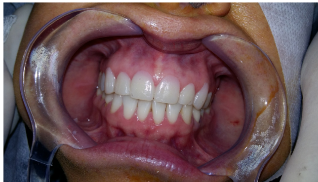
Figure 5 - Mock-up