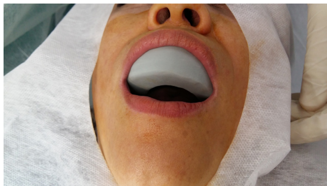
Figure 4 - Silicon wall in mouth

The patient received post-operative instructions and the following medications were prescribed: antibiotic (Amoxillin - 500 mg) every 8 hours for 7 days, analgesic and anti-inflammatory (Ibuprofen-600 mg) every 12 hours for 4 days, and mouthwashes with 0.12% chlorhexidine digluconate every 12 hours for 14 days. The suture was removed after 10 days. Elapsed 4 months, the patient was released to start the prosthetic treatment. After the end of treatment, the patient was followed-up for 1 year, without changes in the restorative and periodontal outcome.