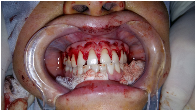
Figure 9 - Image after osteotomy