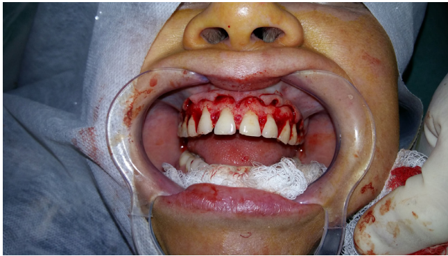
Figure 8 - Total thickness flap raised