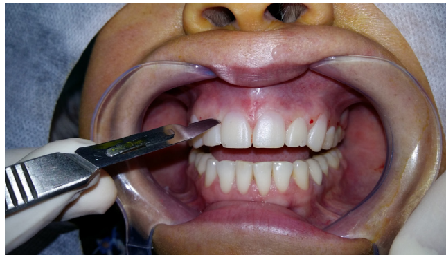
Figure 6 - Inner bevel incision