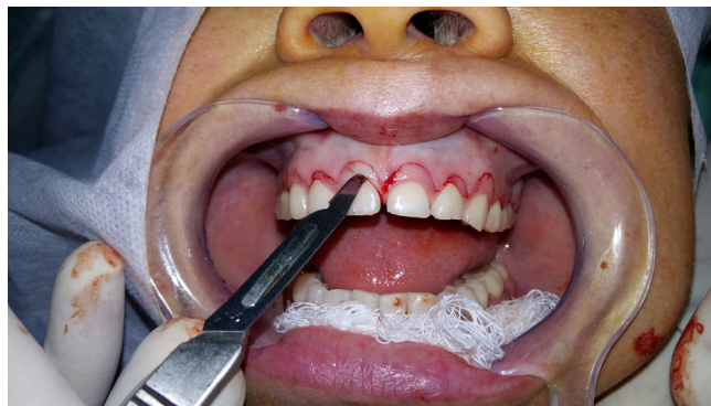
Figure 7 - Intrasulcular incision