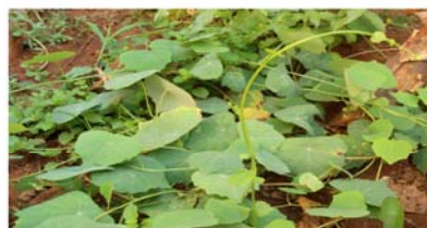
Habit of Stephania wightii

homozygosity of the parent genotype. Callus culture system offer many advantages as a model system for several biological investigations. Here, in the present investigation an efficient protocol has been devised for in vitro callus induction of an endemic medicinal plant, Stephania wightii from young leaf explants.