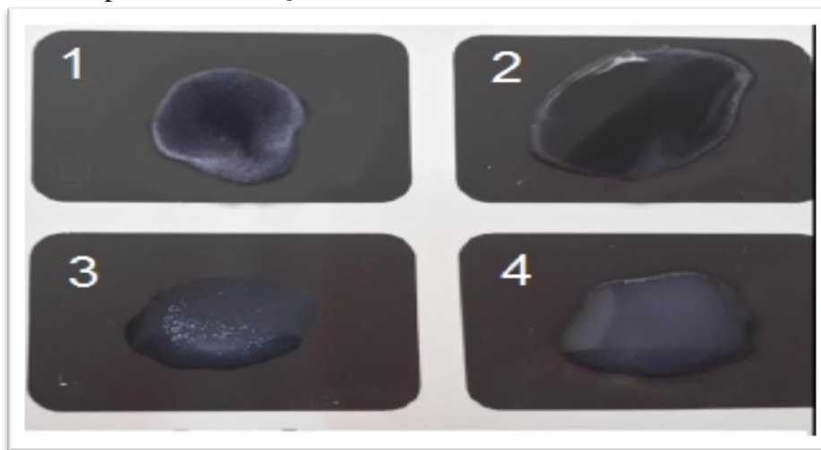
Figure 1: latex agglutination test for identification Toxoplasmosis, well 1: control positive, well 2: control negative, well 3: positive test apparent aggregation of particles in the well, well 4: negative test clear surface without any agglutination.

*L1 =Old airport road,L2= Qodus,L3 =karbala farms