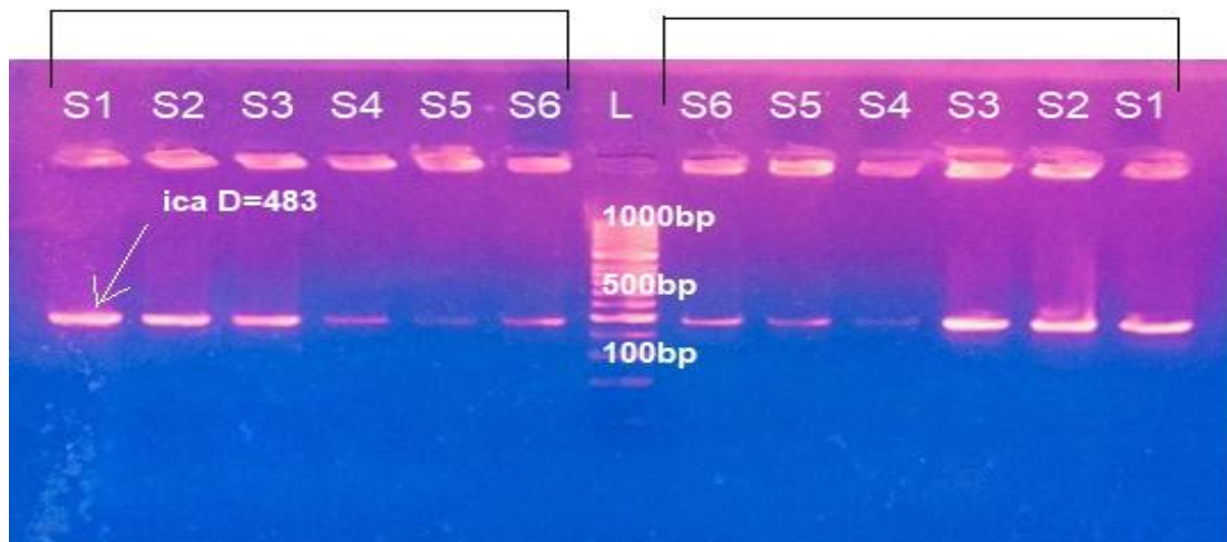
Figure3: Agarose gel electrophoresis (1.5% agarose ) for icaD gene (S1,S2,S3)is S.aureus isolates (,S4,S5) is S.lentus isolates ,S6 is control

The presence an absence of virulence genes in the isolates may be due to the sources of collection of samples ,as the use of detergents and disinfectants in hospitals can lead to a change in the nature of genetic materials constituent of the cells and the disappearance of some these genes (17).