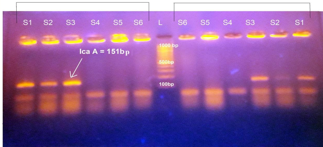
Figure 2: Agarose gel electrophoresis (1.5% agarose ) of icaA gene (S1,S2,S3)is S.aureus isolates (,S4,S5) is S.lentus isolates ,S6 is control

While the result of icaD gene showed that all isolates possessing the gene with two annealing temperature (57.5-60)c° as in figure 3