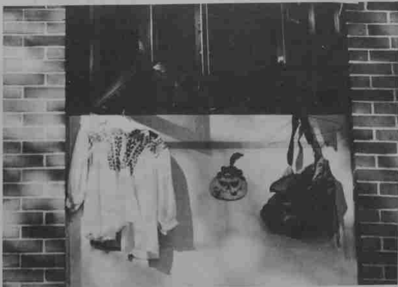
WITH THE IMPENDING onslaught of winter evident, last weekend was enjoyed by many as probably the last of its kind before March or April in Gambier.