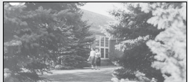
WCSA students on campus.

The WCSA AlumNEWS is available online for those interested in receiving it electronically. If you would prefer to access the newsletter exclusively online, please contact us to request that your name be removed from the conventional mailing list. The newsletter—along with photos and a history of the WCSA—can be found online at morris.umn.edu/WCSA .